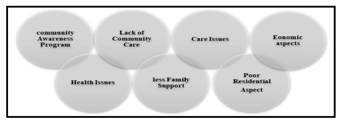
Figure 2 Obstacles confronted by Ageing Population in Malaysia (Researcher's adaptation from Literature)

In order to overcome the issues of ageing population, Malaysia requires policy revision specifically in place of the ageing population; and there is a dire need to involve the private sector as a partner, and develop strong linkages between policy planners, administrators, services implementer, researchers, formal and informal care system, older and young individuals, and most probably the women entrepreneur who comprises of half of population of Malaysia, and owned 15% of businesses in Malaysia. Thus, women entrepreneur entry in ageing centres business will bring a drastic change in care centre business, country progress, and empowerment of women (Vannucci et al., 2017; ACP, 2018).