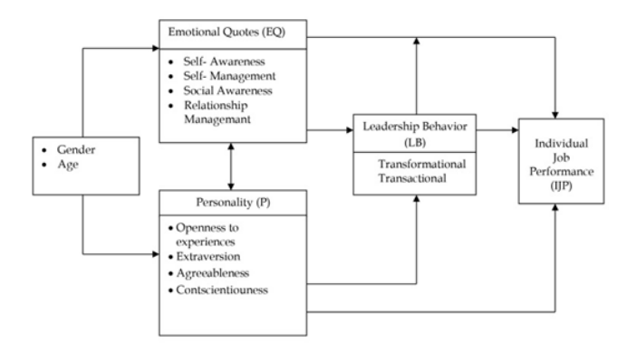
Figure 1 Theoretical framework

The tolerance towards the emotional competence of educator leaders work, in turn, can be influenced by a person's characteristics such as emotional intelligence (EI), personality trait and leadership behavior on work performance (Figure 1) as a theoretical framework proposed in this study.